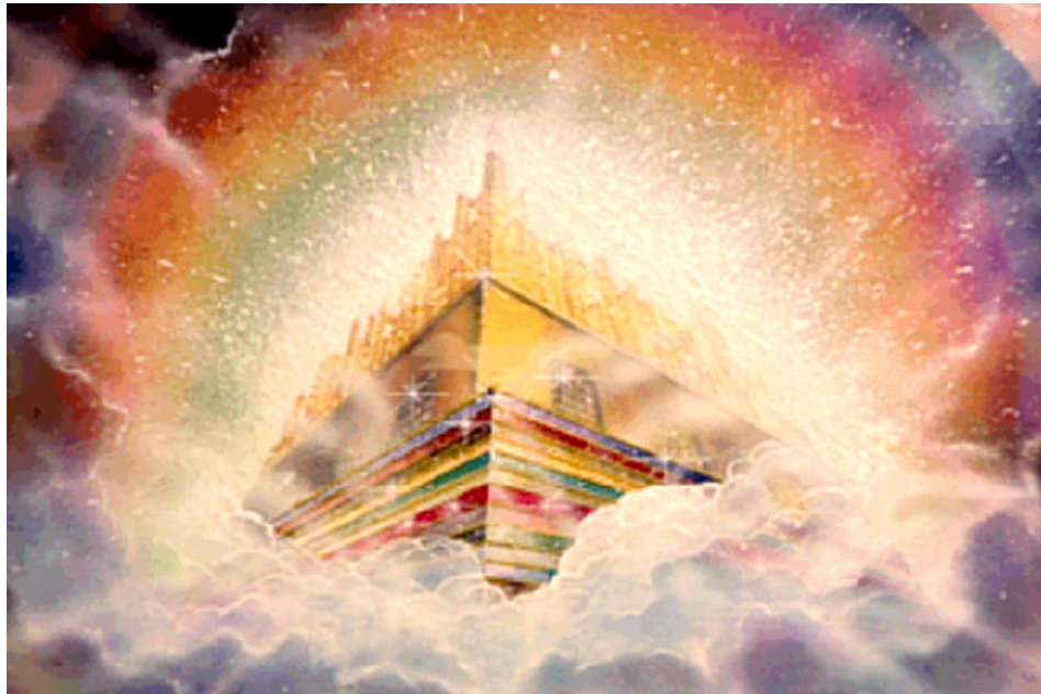
Holy City by Unknown