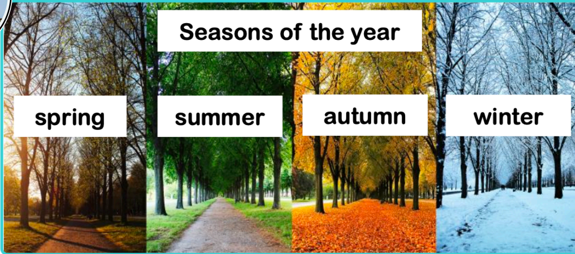
Seasons of the year