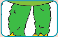
les genoux (m) the knees