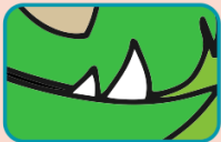
les dents (f) the teeth