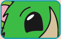
l'œil the eye