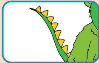
la queue the tail