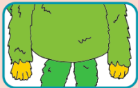
les bras (m) the arms