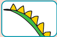
les pointes (f) the spikes