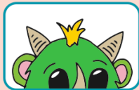
les oreilles (f) the ears