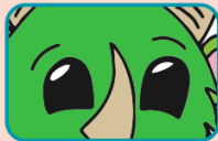
les yeux (m) the eyes