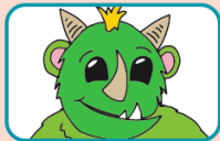
la tête the head