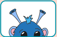
l'antenne (f) the antenna