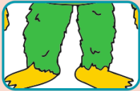
les jambes (f) the legs