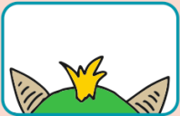
les cornes (f) the horns