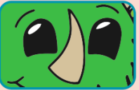
le nez the nose