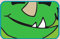
la bouche the mouth