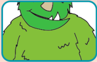
les épaules (f) the shoulders