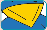
le bec the beak